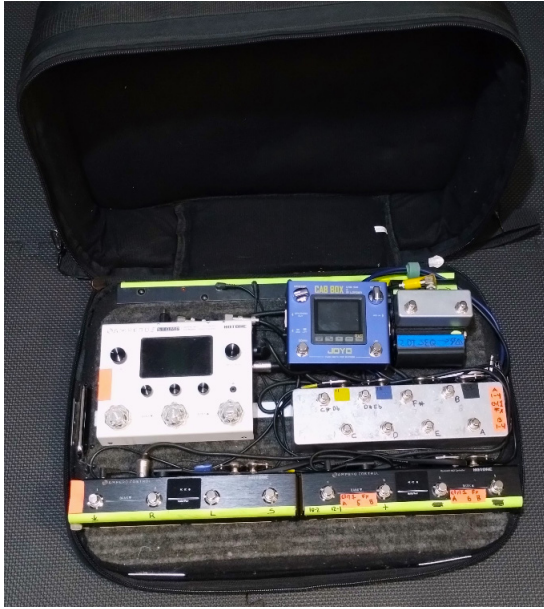
Figure 1. Author's pedalboard within a suitcase-sized carrying bag: guitar modeling processor, IR cabinet emulator, MIDI controllers and DI box.

quickly onstage is the practical option (Figure 1); on the other hand, showing off heavy and bulky analog valve or solid-state Marshall, Randall or Mesa Boogie full stacks has symbolic value within the traditional metal concerts aesthetics (Figure 2).