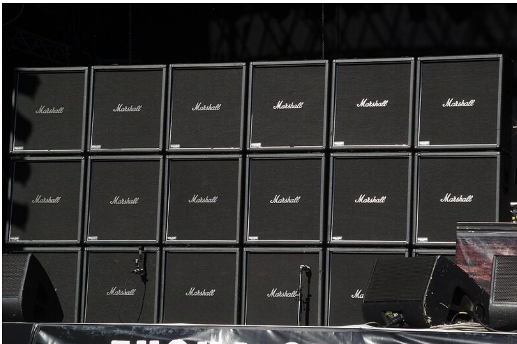
Figure 2. A 3 x 6 stack of Marshall guitar cabinets (the setup of Jeff Hanneman from Slayer) on the Tuska Open Air Metal Festival main stage in 2008. Note that only two cabinets are miked, pointing only one speaker within each cab (Date 29 June 2008. Source: super work. Author: Jaakonam. Creative Commons Attribution-Share Alike 3.0 Unported license).