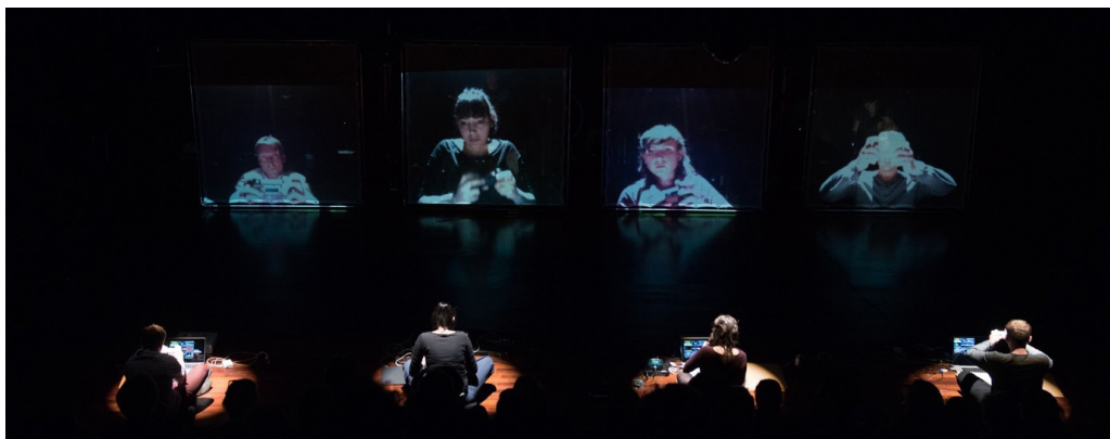
Figure 3. Nadar Ensemble performing Generation Kill by Stefan Prins at the Gaudeamus Muziek Week.