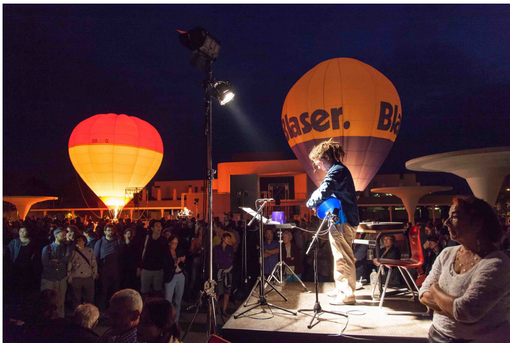
Figure 1. Nadar Ensemble performing Exit F by Michael Maierhof during ‘Dead Serious’ 2014.

Nadar’s idiosyncratic segues and transitions consistently seek to incorporate all required technical details (such as staging, lights, backdrops, etc.) into the style of the program. Another example Nadar program that demonstrates this approach can be found in the various iterations of the ‘Doppelgänger’ concerts. 8 Here, the ensemble’s musicians and crew must transition often between Generation Kill and Exit to Enter (2013), a work by Michael Beil. Both pieces have a fixed setting that is vastly different from the other. In Generation Kill , the ensemble sits in two rows of four musicians spaced five meters apart with the musicians sitting upstage and each staged behind a semi-transparent screen. In Exit to Enter , the ensemble sits bunched together on stage left, while the middle of the stage must be kept free for video recordings and projection. Because of the disparate staging, this represents one of the ensemble’s more complicated changements . Since both pieces use video as an instrument and because Beil admittedly was heavily inspired by the film maker David Lynch (Gielen and Moore 2023), it seemed appropriate to Matthyssens and Prins that the ensemble’s musicians mimic the filmmaker’s style and practice and record themselves doing the transition backwards during rehearsals. This recording is then played back (projected on a horizon screen) in reverse during the very same concert segue and, of course, in synchrony with the live version.